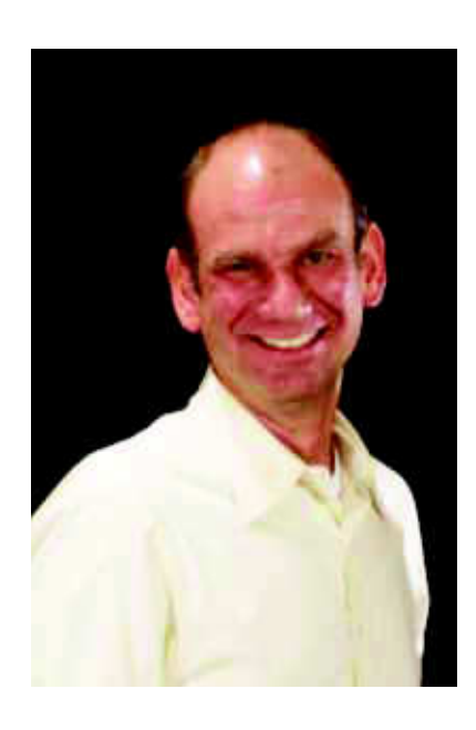
Eddy Doumas worth interiors