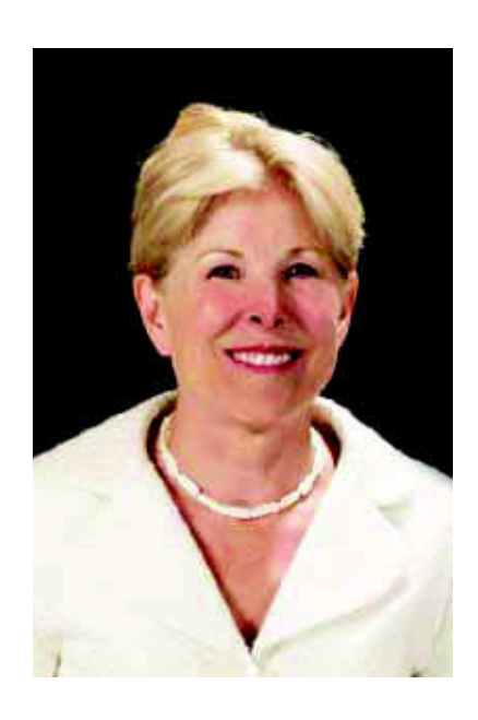
morningstar interior design